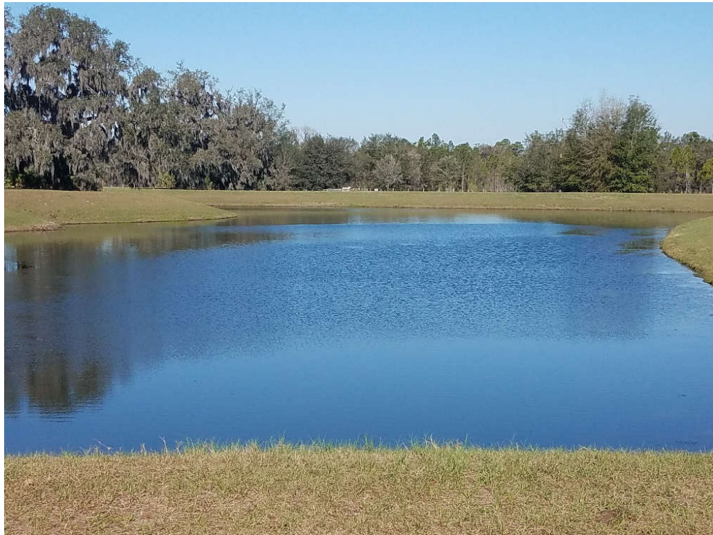
Photograph 1. Example of a stormwater management facility (wet retention)

The FishHawk Ranch West Homeowners Association, Inc. is responsible for the internal stormwater system and the private rights-of-way within the Sagewood and WestLake neighborhoods. The Encore at FishHawk Ranch Homeowners Association, Inc. is responsible for the internal private rights-of-way within the Encore neighborhood.