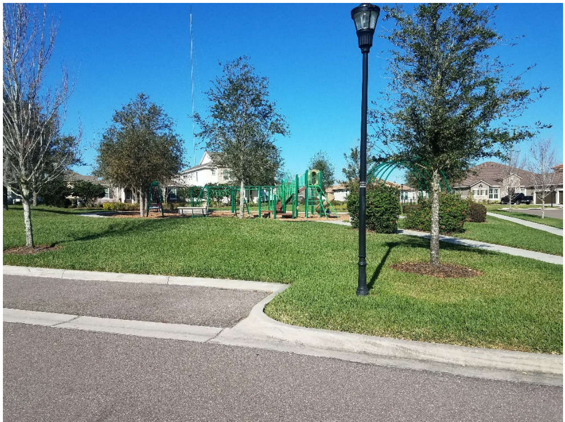
Photograph 7. Tot lot/playground at Central Park

In addition to these neighborhood parks, there are several public open spaces, preserving natural trees and vegetation, while connecting areas of the community with pedestrian pathways.