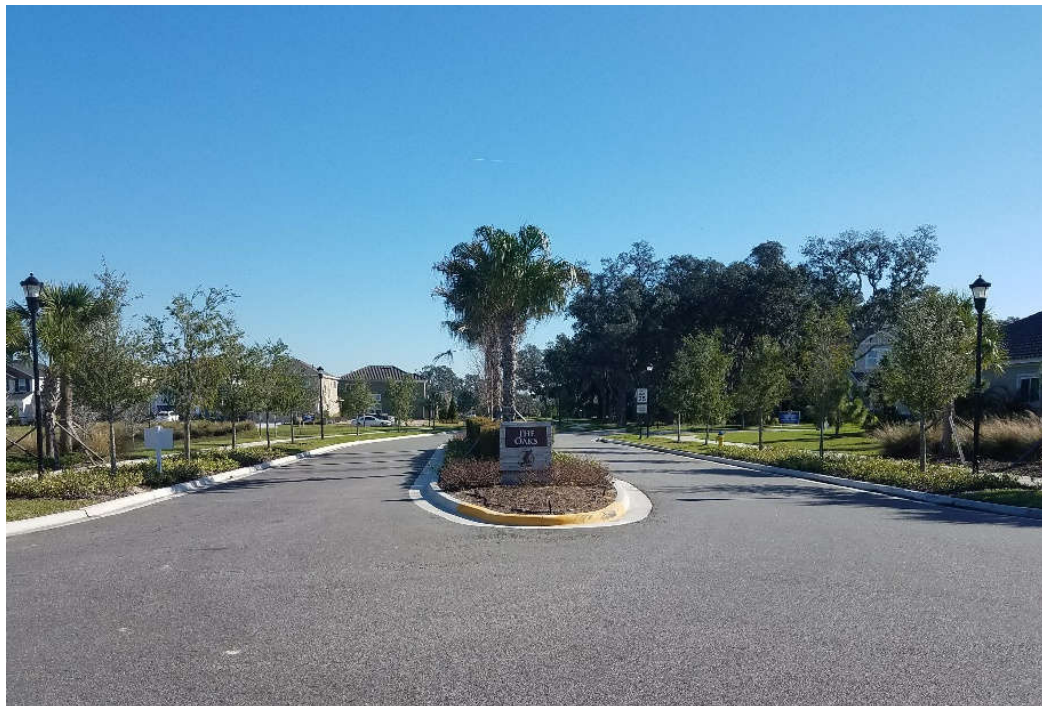
Photograph 6. The Oaks Neighborhood entry sign