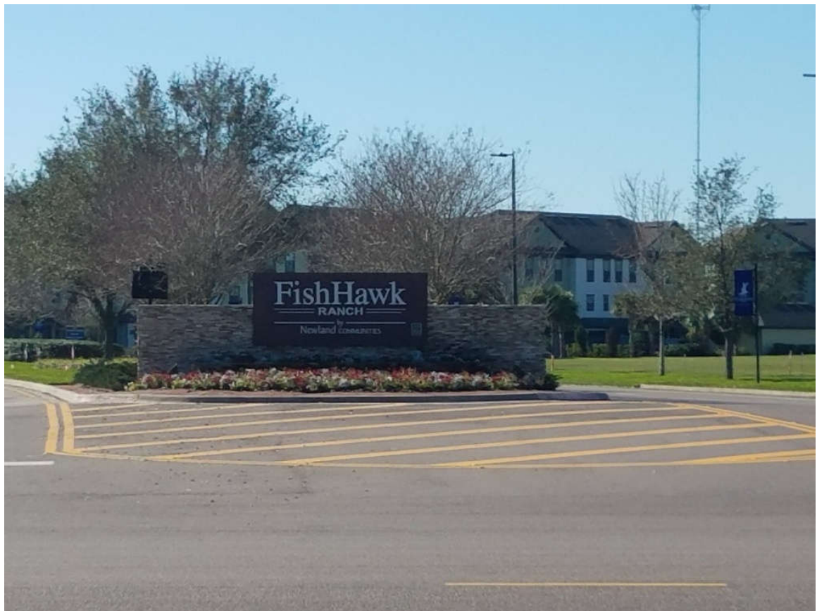
Photograph 3. FishHawk Ranch (West) main entry sign

The FishHawk Ranch (West) entry monumentation is located on Circa FishHawk Boulevard near its intersection with FishHawk Boulevard. The monumentation consists of a median sign south of FishHawk Boulevard in the Circa FishHawk Boulevard median near the intersection, and decorative walls in on the east and west sides of Circa FishHawk Boulevard. Some of the entrance features are located within tracts owned by the District and some are located within privately owned tracts within easements in favor of the District. However, some of the median features are located within Hillsborough County owned right-of-way. The District has a License and Maintenance Agreement with Hillsborough County to allow for operation and maintenance of these features and their surrounding landscaping and irrigation.