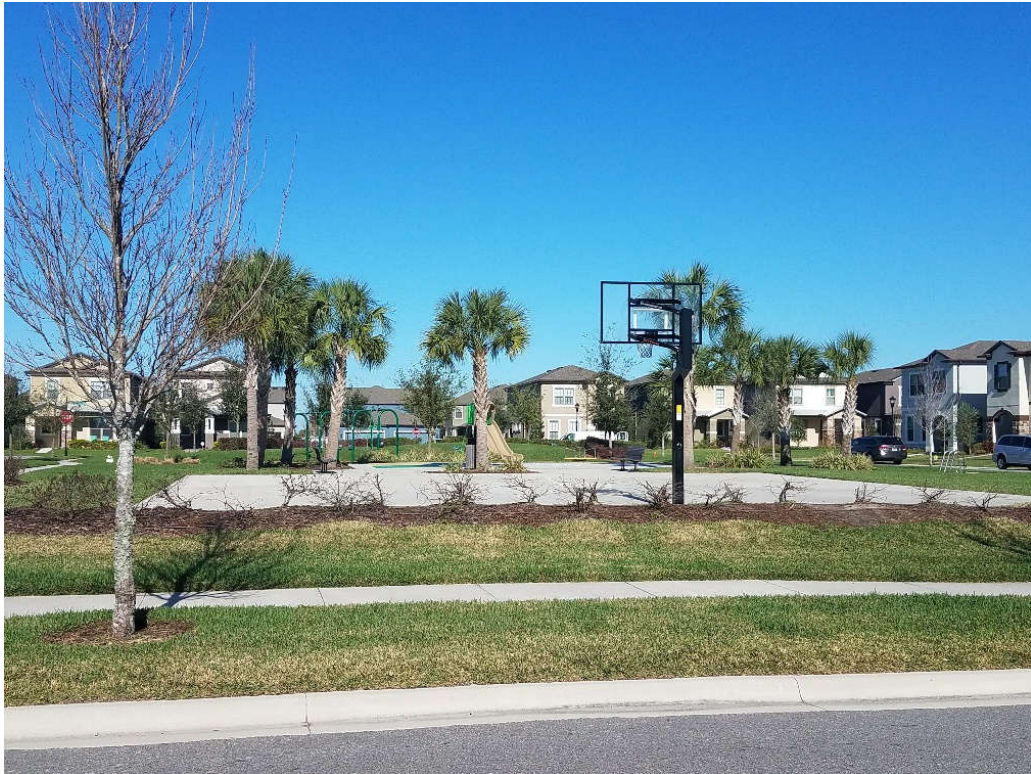
Photograph 8. Sports Court / Neighborhood Park