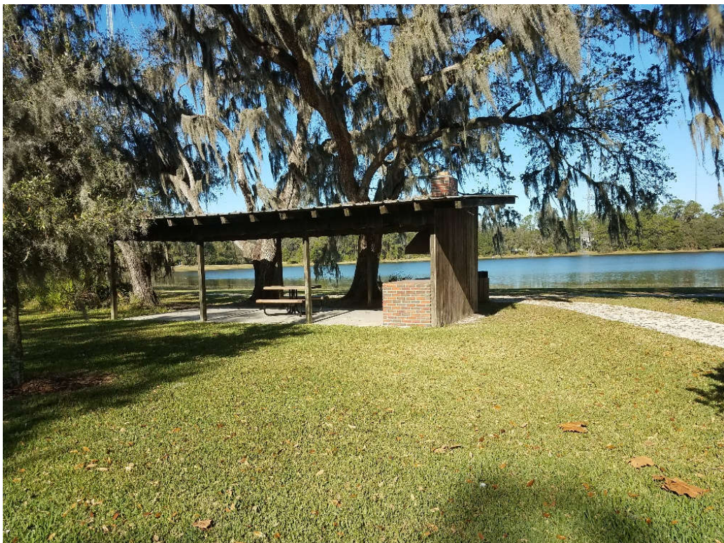
Photograph 9. LakeHouse Pavilion