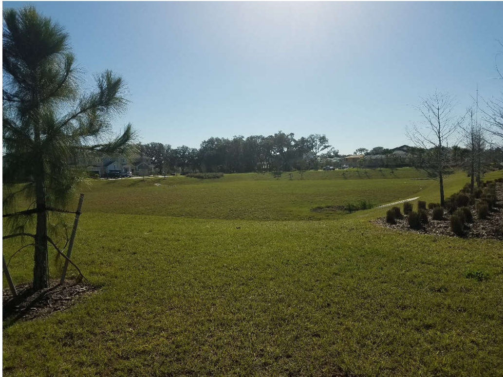
Photograph 2. Example of a stormwater management facility (dry detention)