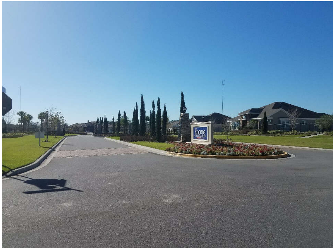
Photograph 4. Encore Neighborhood entry sign

It should be noted that additional entry features, located at the intersections of Watercolor Drive and Boyette Road and Village Center Drive and Boyette Road may be constructed by the Developer. If constructed, they will be located within District-owned tracts and will be maintained by the District.