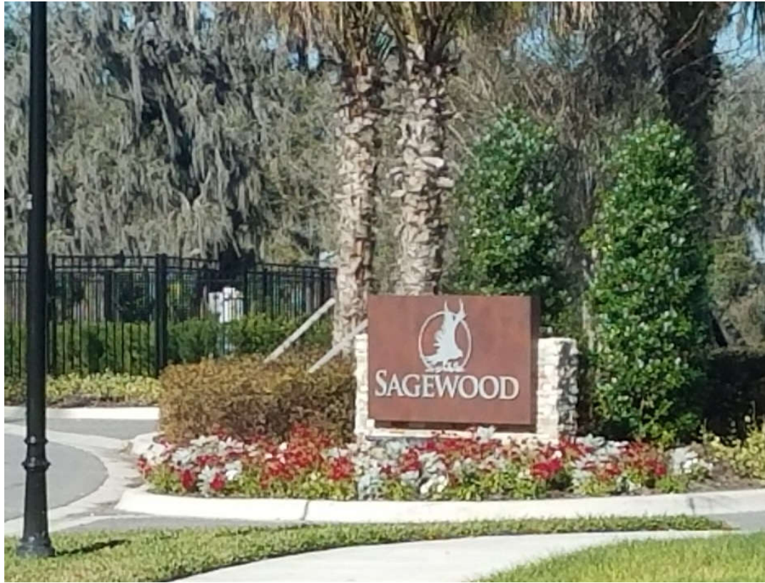
Photograph 5. Sagewood Neighborhood entry sign